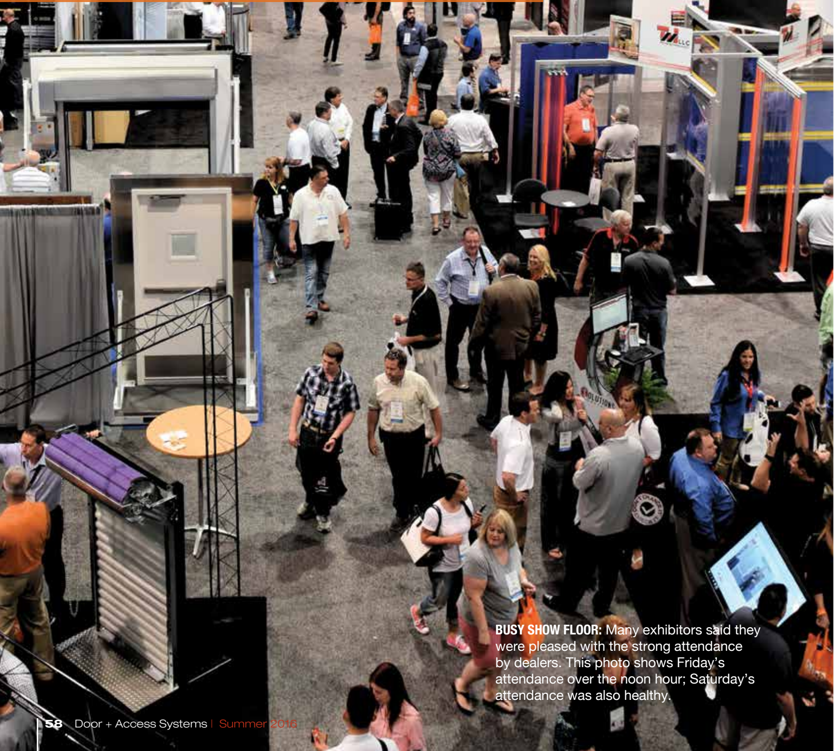
BUSY SHOW FLOOR: Many exhibitors said they were pleased with the strong attendance by dealers. This photo shows Friday's attendance over the noon hour; Saturday's attendance was also healthy.