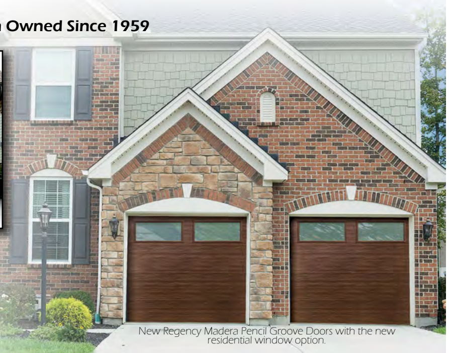
New Regency Madera Pencil Groove Doors with the new residential window option.