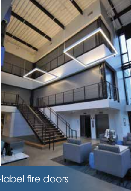
S-label fire doors

SH: Unfortunately, there are two common critical mistakes that can adversely affect the performance of a rolling fire door in a fire condition, and both are related to incorrectly installing the fusible link release cable or chain. NFPA 80 requires a fusible link to be located within 12" of the ceiling on both sides of the wall (but not in the triangular dead-air space 4" back from the wall or 4" down from the ceiling).