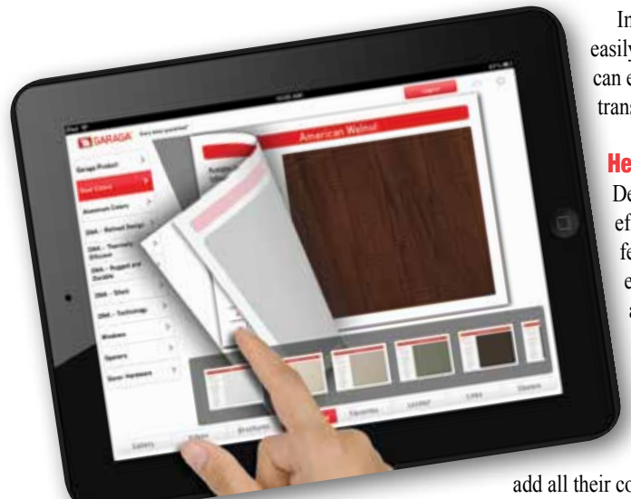
continued from page 38

Depending on the software used, the customized image can be incorporated into a detailed quote that can be instantly emailed to the customer. Some apps even allow the dealer to place the order with the manufacturer right from the same tablet.