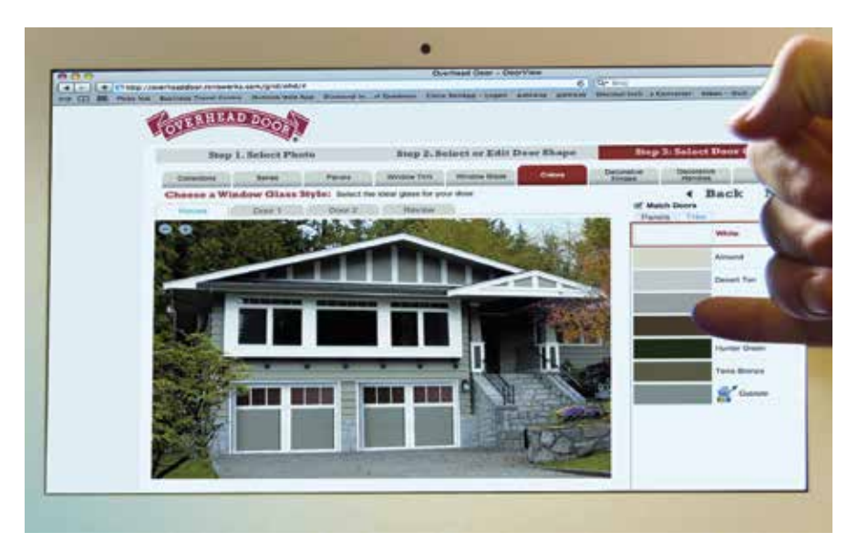
Overhead Door's DoorView makes it quick and easy to select a color.

"It's very, very easy to use," adds Martin continued on page 42