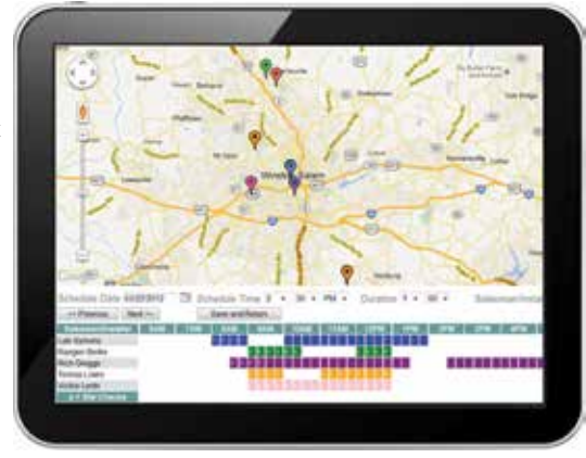
Amarr's Onsite also lets you schedule visits to customers.

With six potent words, David Pace summed up the critical advantage of selling doors with a tablet: "We're days ahead of our competition."