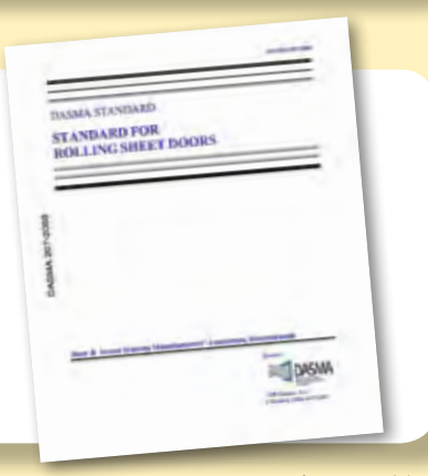
continued on page 34

The newly approved standard can be freely viewed and downloaded at www.dasma.com.