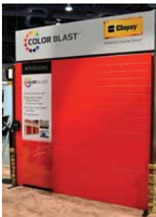
▲ COLOR BLAST: Clopay's new custom paint program offers over 2,000 Sherwin-Williams colors for most Clopay steel doors.

To help its Master and Authorized Dealers sell doors, Clopay has developed a guided selling program called MyDoor. A Web-based application that can be run from tablet or desktop computers, MyDoor provides a professional selling experience that increases upselling and closing ratios. www.clopaydoor.com