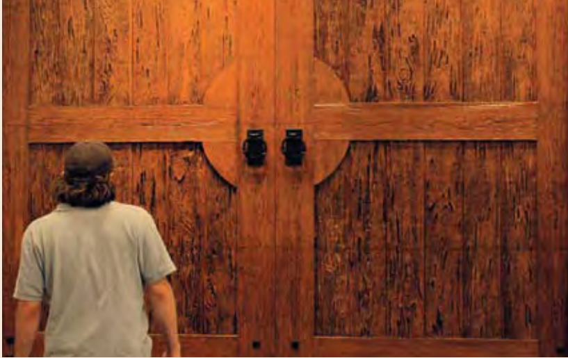
Clopay Canyon Ridge Collection