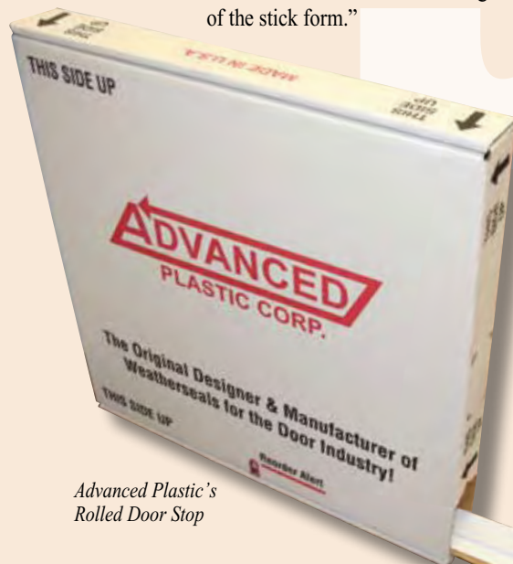
Advanced Plastic's Rolled Door Stop