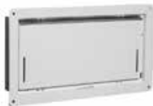
Insulated and Dual Function models available