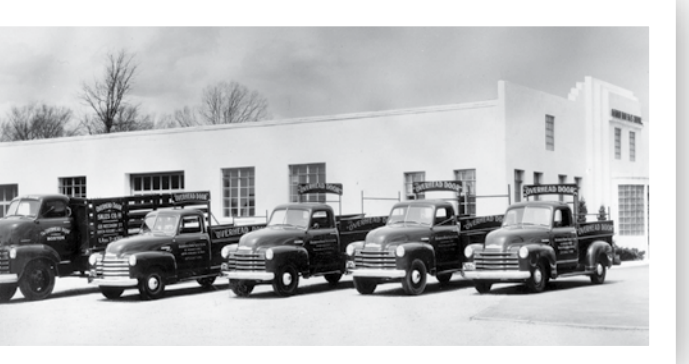
Fimbel trucks, 1950