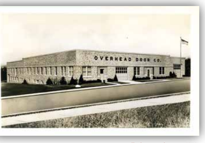
Hillside, N.J., plant, ca. 1950s