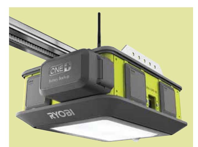
THE FOCUS OF THE DISPUTE: Launched in April 2016, the Ryobi GD200 opener offered several features that were new to the residential garage door opener industry.

The district court said that Chamberlain had "established a likelihood of success" in proving patent infringement. Chamberlain seeks to stop Techtronic from importing the Ryobi GD200 opener, which is alleged to infringe on five specific CGI patents that involve battery backup, data