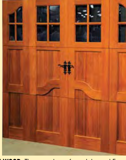
MORE WOOD: The percentage of wood doors at Expo increased to 24 percent of all residential garage doors displayed, up from 15 percent in 2007 and 21 percent in 2008. Pictured: A new offering from Richards-Wilcox.