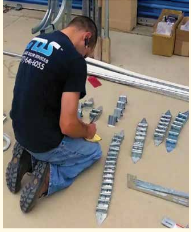
ON THE JOB: A GDS technician takes inventory.

On Jan. 16, 2015, the California Contractors State License Board (CSLB) suspended the license (# 927739) of Garage Door Services. Additionally, on June 29, the CSLB filed a disciplinary action pending against them for advertising without a valid license. A