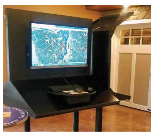
ON THE BIG SCREEN: Kitsap's big kiosk conveniently displays the location of all their trucks.