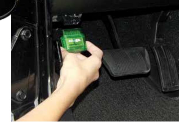
INSTALLED: The GPS tracking device is typically installed under the truck's dashboard in the OBD-II port.

The lesson? Today's GPS systems can go far beyond knowing a truck's location. They can help a door or gate business become more efficient and more profitable.