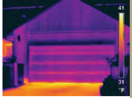
This is a thermal image of the garage in Holladay, Utah.

A thermal image, provided by TerraSun Energy, shows the energy efficiency of the Martin door. Early test results show the new garage door saved energy.